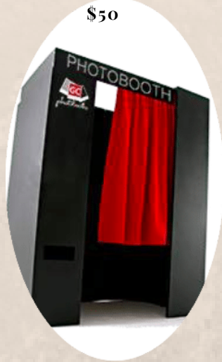
Photo Booth & props

Capture countless memories with a photo booth hire. Includes unlimited photo strips and digital copies of all photos.